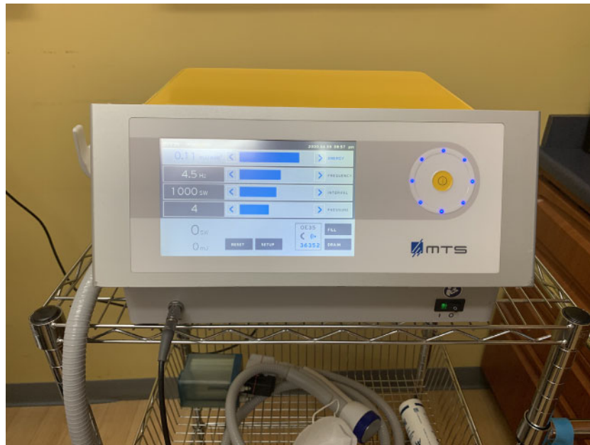
Fig. 1. OrthoGold 100™ shock wave device.

53.7 ± 14.9 to 75.7 ± 16.7 ( p < .001 ), from 38 ± 15.2 to 71.8 ± 23 ( p < .001 ), from 55.8 ± 16.4 to 71.4 ± 18 ( p < .001 ), from 42.4 ± 21.5 to 59.4 ± 20.3 ( p < .001 ) and from 44.9 ± 16.4 to 69 ± 23.9 ( p < .001 ), respectively (Table 2). Eighty-eight (81.5%) patients were satisfied with the procedure at final follow-up. The 20 patients who did not achieve pain relief following ESWT underwent a trial of local PRP injection. Six patients failed PRP and ended up with minimally invasive plantar fascia release surgery.