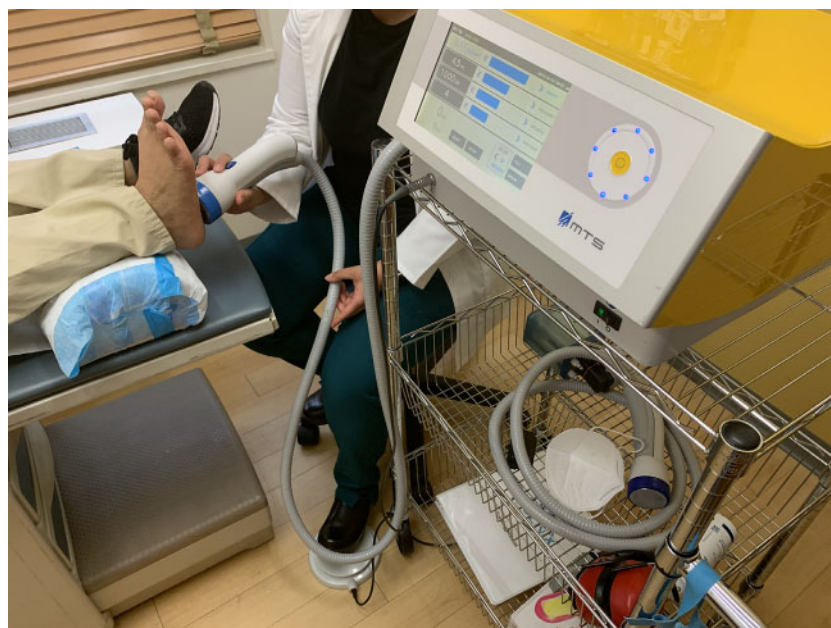
Fig. 2. Clinical picture of patient receiving treatment with OrthoGold 100™ shock wave device at point of maximal tenderness.

The PF plays a major role in maintaining the arch of the foot and is subject to tensile stress with weight bearing and locomotion (7). The proximal portion that attaches to the calcaneus is composed of long fibers of fibrocartilaginous tissue that has been described as vascular, innervated, and metabolically active (7). The pathogenesis of PF is not well understood. One common theory is that repetitive microtrauma to the insertion point triggers inflammation, leading to degenerative